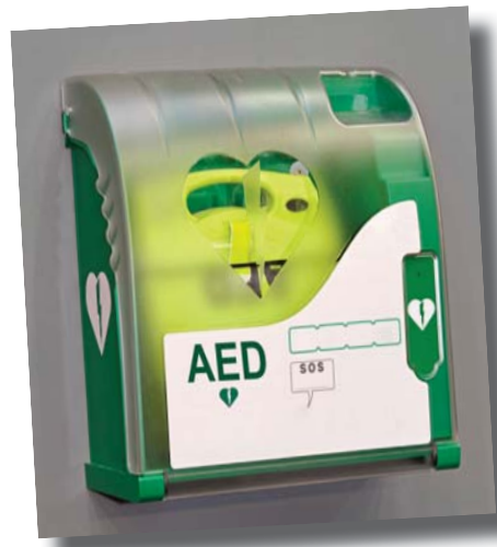
AED unit for the New Life Community Church

Your cooperative is dedicated to helping the people in our service area, not just by keeping the lights on, but by making a positive impact on the quality of life. The People Fund is proud of the positive impact it has had in increasing security, safety and health-awareness within communities. The organization has also helped to prepare and educate our community's growing children by funding several local educational programs for students from elementary to college.