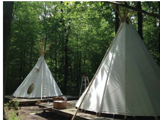
Provided funds for replacement camp items for Flying Horse Farms