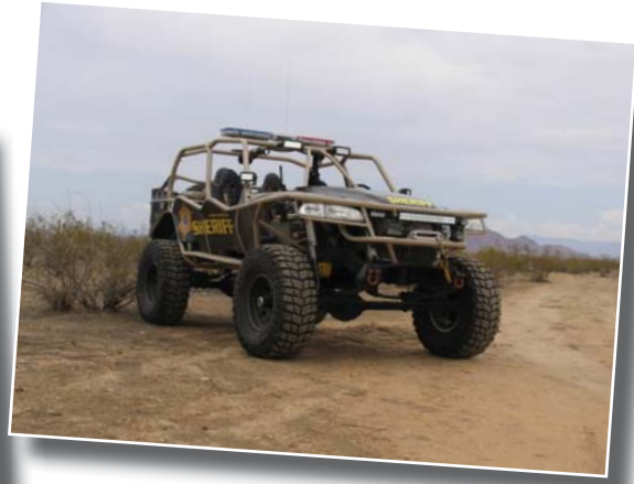
Provided funds for an ATV for the Morrow County Sherriff's department

The People Fund, funded through its members, by Operation RoundUp®, has proven to be a successful program providing financial assistance to non-profit agencies and community activities in our area.