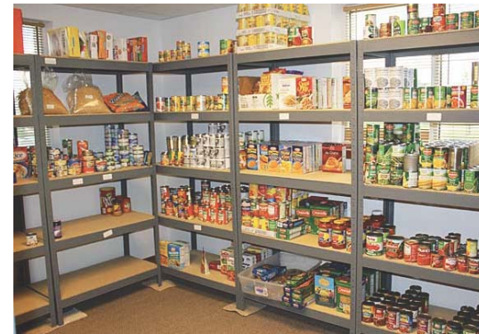
Provided funds for local food pantrys