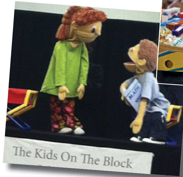
Donation to Kids On The Block, Central Ohio

Deep appreciation is extended to participating members, and to the foundation's board of directors for their dedication and determination to make our community a better place by supporting our neighbors in need.