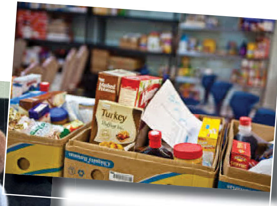
Donation to local food pantries